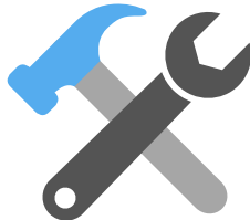
Maintenance Work Orders